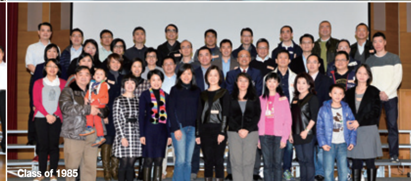
Class of 1985