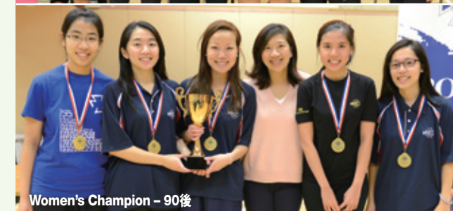
Women's Champion – 90後