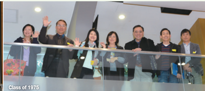
Class of 1975