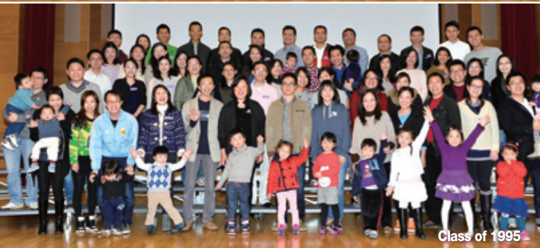
Class of 1995