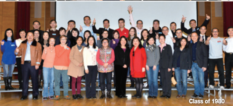
Class of 1980