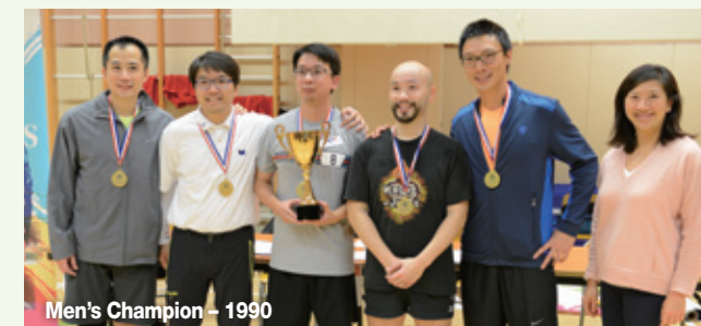
Men's Champion – 1990