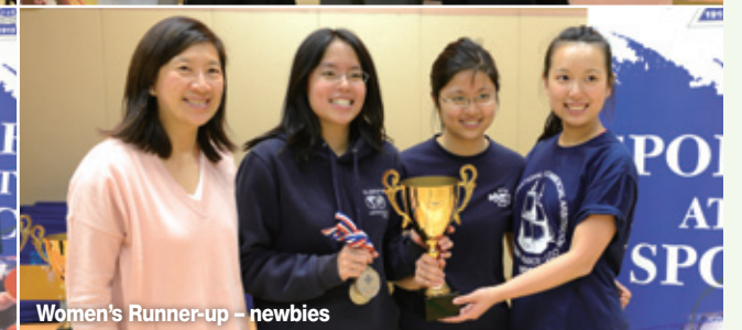
Women's Runner-up – newbies

一年一度由母校籌辦的乒乓球比賽，今年1月10日再次在聖保羅男女中學室內運動場館舉行。今屆參賽的隊伍比往年更多，校友們紛紛依畢業年份組隊，氣氛熱鬧。我們這班1990年畢業生今年再次組隊參加男子和女子組比賽，經過一輪苦戰，男子隊成功衛冕，連續第二年捧走冠軍獎盃。