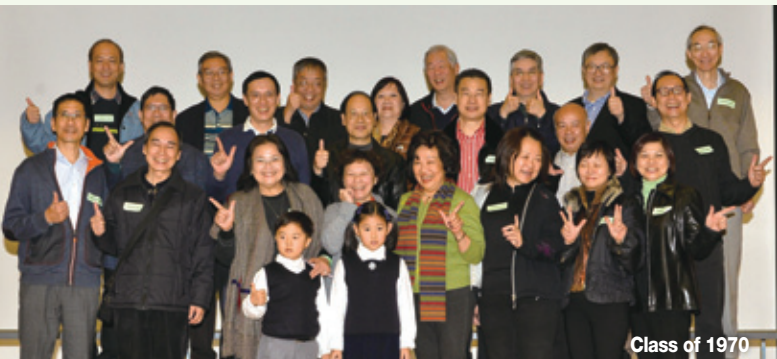
Class of 1970

The annual Alumni Homecoming Day was held on 13 December 2014, with a participation of around 500 alumni from Classes of 1970, 1975, 1980, 1985, 1995, 2000, 2005 and 2010.