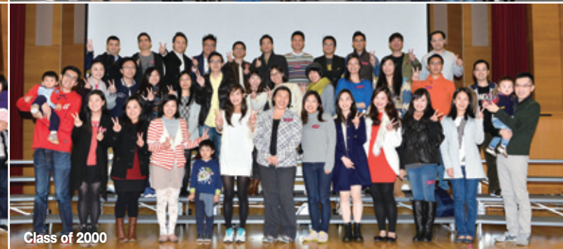
Class of 2000