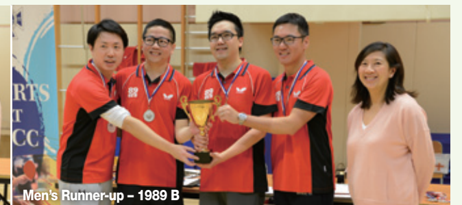
Men's Runner-up – 1989 B