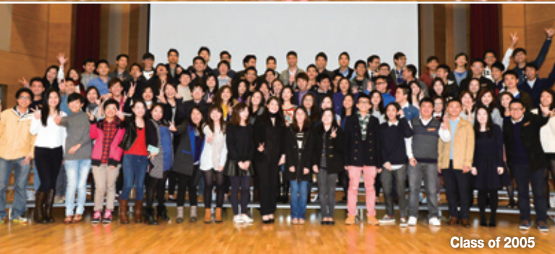
Class of 2005