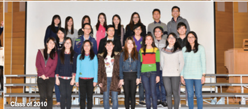
Class of 2010