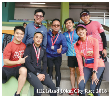
HK Island 10km City Race 2018

感恩遇到一班志同道合、甘願無私付出的隊友，希望我們的團隊精神會吸引更多校友積極參與。2019年我們會繼續充滿活力，以生命影響生命，向前跑得更遠！