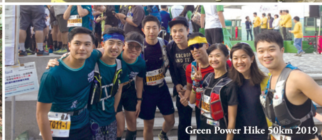
Green Power Hike 50km 2019