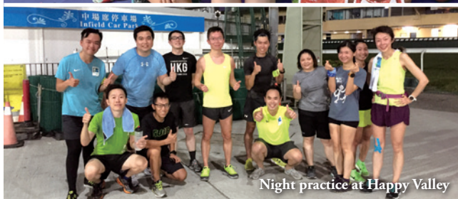
Night practice at Happy Valley