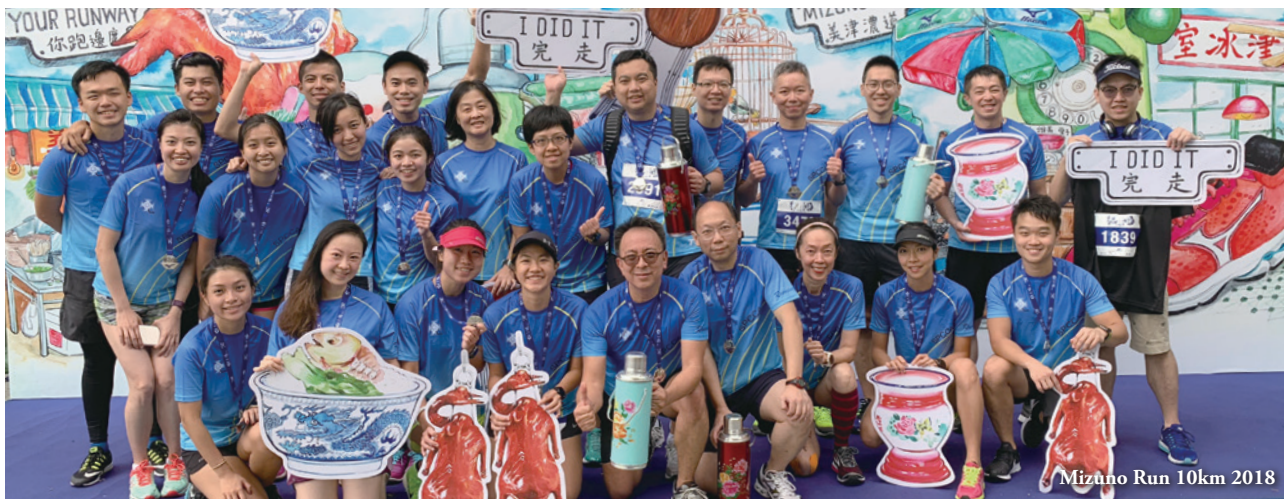
Mizuno Run 10km 2018