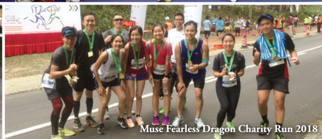
Muse Fearless Dragon Charity Run 2018